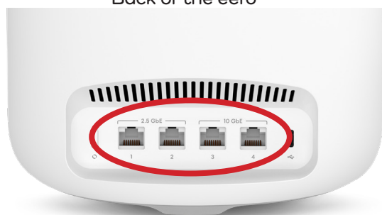
Back of the eero

* You will need to identify if your Redtrain service has an NTD is located outside on an external wall, an NTD located inside your home (often in the garage) or just an internal ethernet port wall socket (some apartment buildings) to connect to. If the Redtrain NTD is located outside there will be internal data ports where you connect your eero device. If your NTD is located inside you can either connect direct to it or use internal data ports if installed.